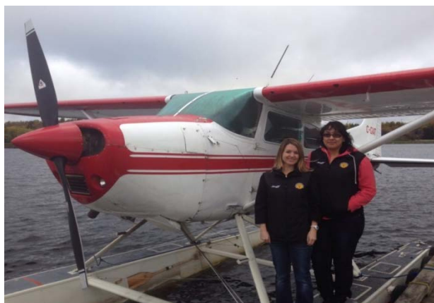
Waasegiizhig Nanaandawe'iyewigamig AHAC Primary Health Care Providers

Waasegiizhig Nanaandawe'iyewigamig (WNHAC) provides comprehensive primary health care services to ten First Nations with twelve points of service in northwestern Ontario as well as the urban Anishinaabe and Métis population in Kenora. Uniquely, WNHAC provides a broad spectrum of children's oral health services to 9 of the 10 First Nations it serves.