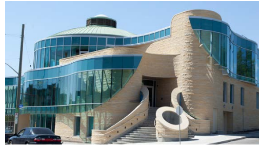
Wabano Centre for Aboriginal Health

At the heart of the AHAC Model of Wholistic Health and Wellbeing is “culture” and the interpretation of Indigenous “ways of knowing and being”. Wabano Centre for Aboriginal Health in Ottawa is an example of the vibrant community health that can be achieved through celebrating Indigenous cultures and artfully living the AHAC Model of Wholistic Health and Wellbeing.